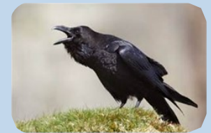
John C. Maxwell

People ask the difference between a leader and a boss. The leader leads, and the boss drives.