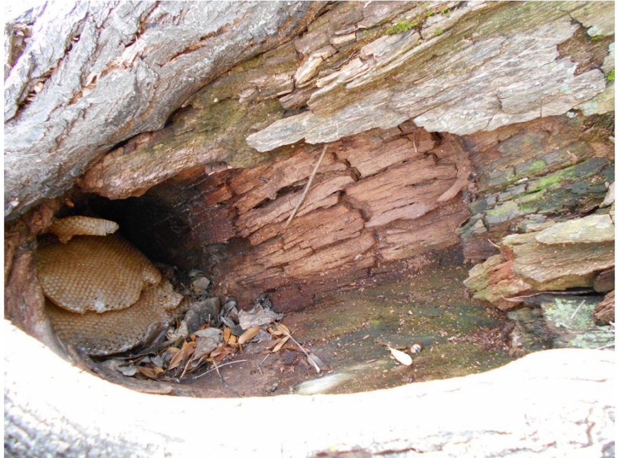
Honeycomb tucked away — from Dorothy Thetford