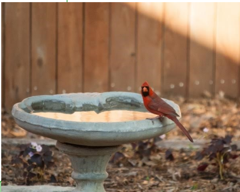
Here's lookin' at cha!