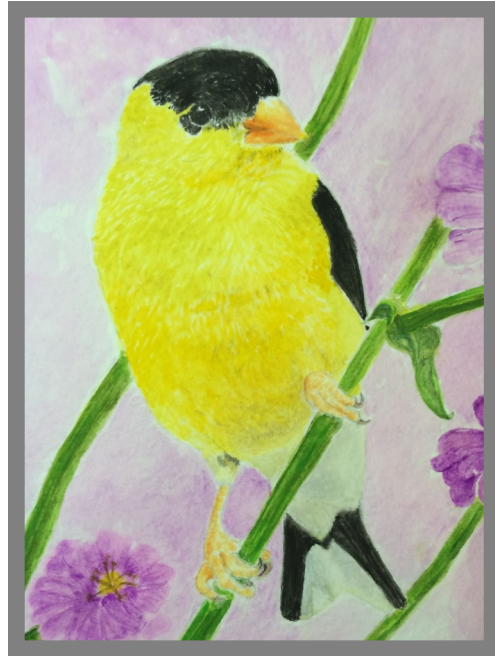
American goldfinch—w odum