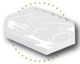
Wood pellet bags