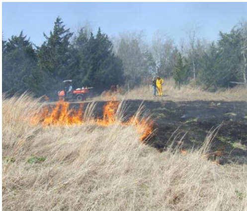
Prescribed Native Prairie Burn

Historically, large herds of bison, sometimes as large as 1,000 animals, ranged the prairies and savannahs, where they would consume quantities of grasses, trample organic matter, and then distribute seed into the disturbed soil. The grazing pressure was not continuous, and the large herds would move on allowing the grassland to recover. Today, cattle ranching with rotational grazing and haying provide a similar impact.