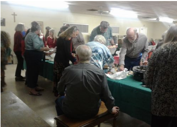
The serving table was loaded with many delicious dishes.