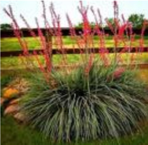
Texas Red Yucca

Description: See listing of available plants at https://npsot.org/wp/sanantonio/bexar-roots-sale-list/