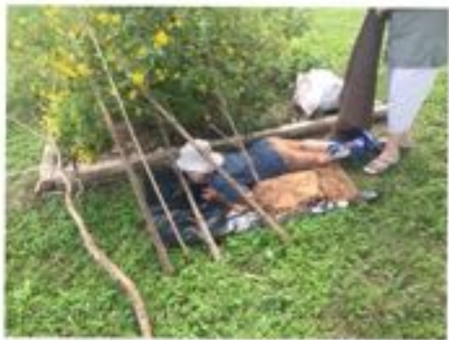
This is how I get into bed?