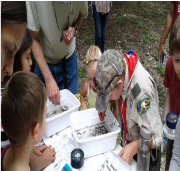
Wonder what this boys was watching the the tub? He was obviously invested in the activity!