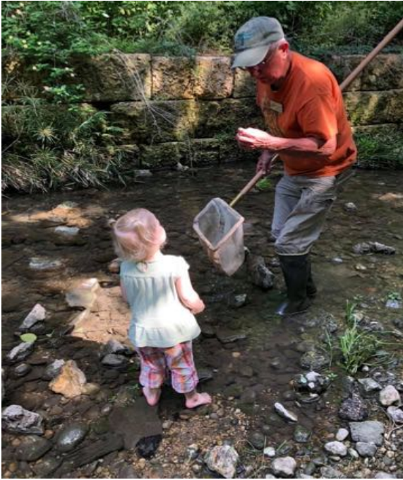
This little girl was fascinated with something Tom captured in the kick net.

The May Discover program, “Discover What’s Swimming,” was a BIG hit with children and their parents alike! A large number of participants attended at both Crescent Bend and the Seguin Public Library.