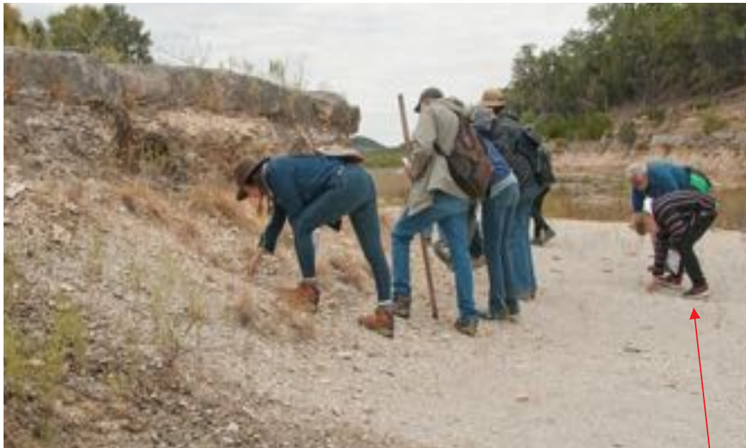
Heads down and butts up! This is how we searched for some of the Gorge fossils. My 12 year old grandson enjoyed the tour, too, especially searching for fossils.