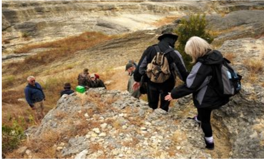
Terrain designed for mountain goats! The class had some steep and rocky areas to traverse