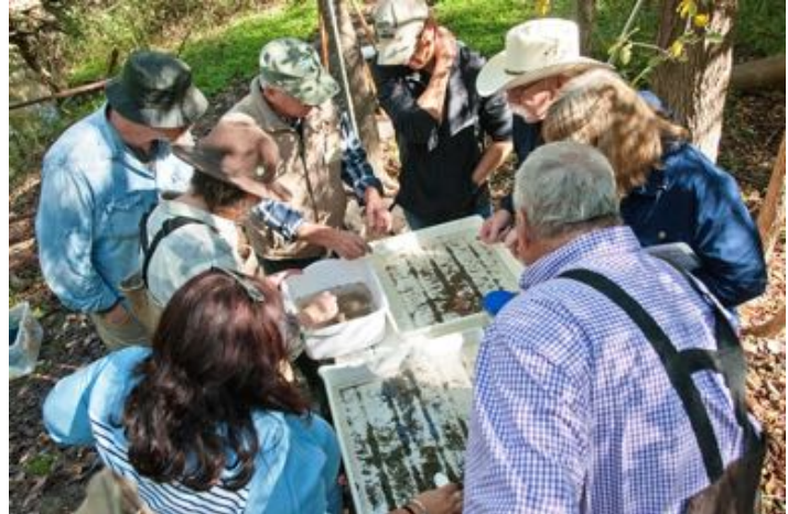
Group enjoys “bug picking.”