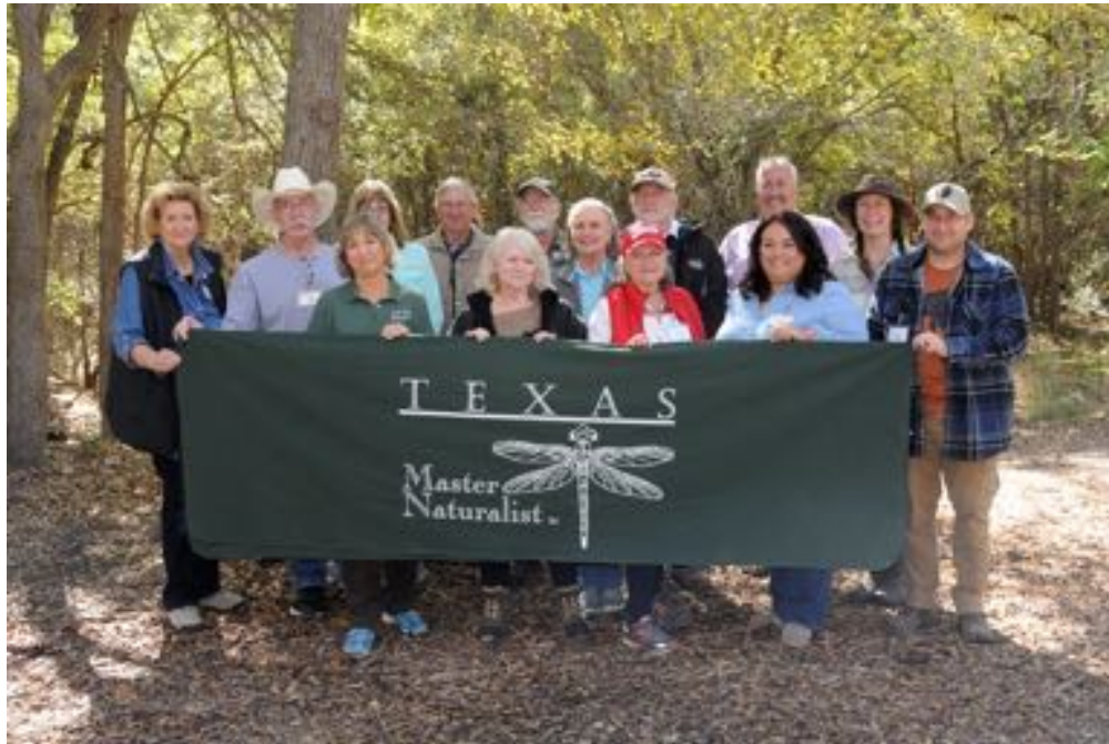
Class 5 Group Picture