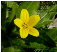
Lindheimera texana : Texas Star

Hill Country Master Naturalist Newsletter Editor 431 Timber Ridge Kerrville, TX 78028