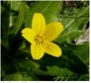
Lindheimeria texana : Texas Star