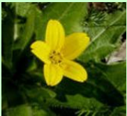
Lindheimera texana: Texas Star

Editor, The Texas Star 431 Timber Ridge Kerrville TX 78028