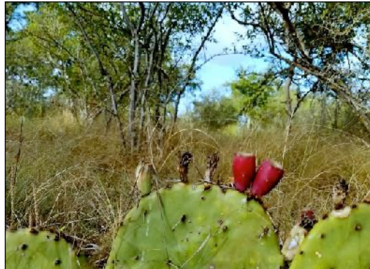
Follow the color. Prickly Pear Fruit