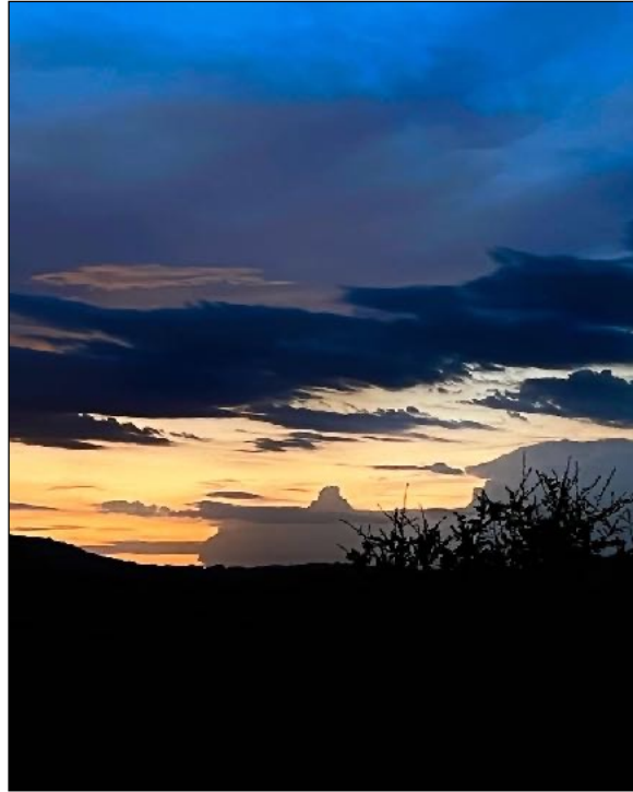
Drought relief on the horizon?