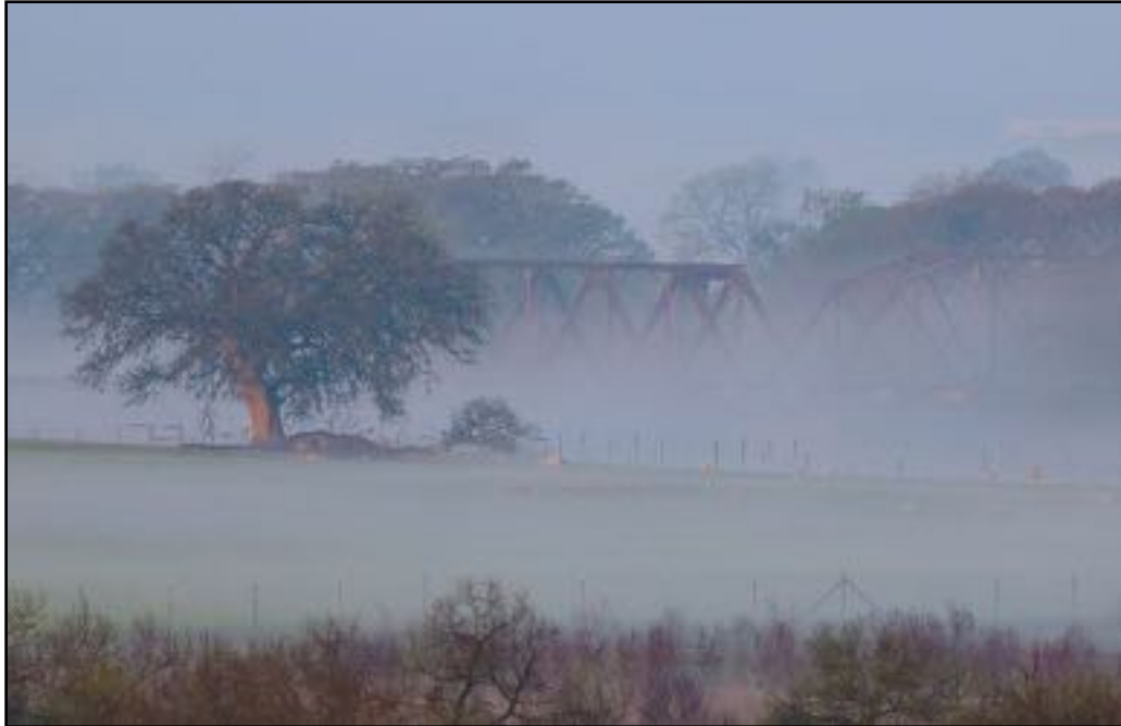
Foggy bridge over the Guadalupe