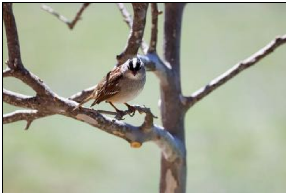
White-crowned Sparrow spends the winter with us.

Sometimes a walk in spring is enough, noticing up, noticing down. Sometimes in each day's paintbrush of green across the view, a world glows in soft focus. Sometimes a fistful of asparagus, sometimes the aria of wren. Sometimes the citrus crush beneath my feet. Sometimes a walk in spring changes everything.