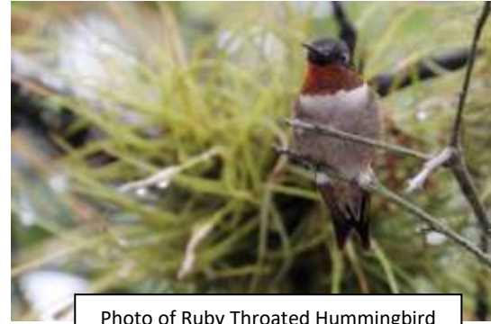
Photo of Ruby Throated Hummingbird

“Citizen Science” is the participation of non-scientists in scientific research. As naturalists, many of us already participate in citizen science projects that contribute to the body of scientific knowledge about plants, animals & insects: butterfly surveys, bird counts, plant identification. AND we take pictures – LOTS of pictures! Each picture is an observation and represents an opportunity to increase the scientific knowledge of what, where & when. One of the largest citizen science projects is iNaturalist, a world-wide, on-line database of observations provided by citizen scientists like Master Naturalists.