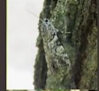
Little Lined Underwing