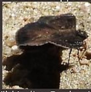
Wild Indigo Duskywing