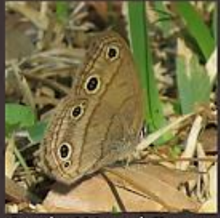
Little Wood Satyr