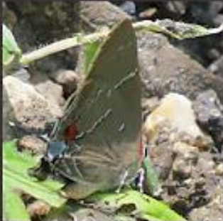
White M Hairstreak